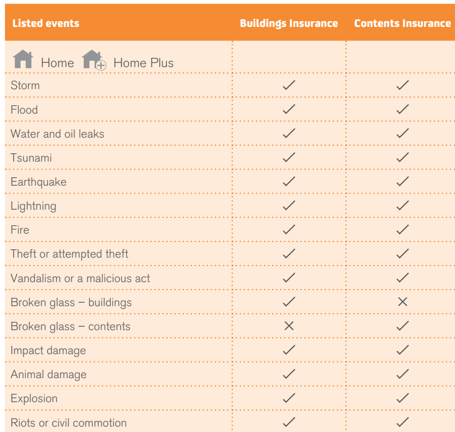
Table 3.1 – Listed events