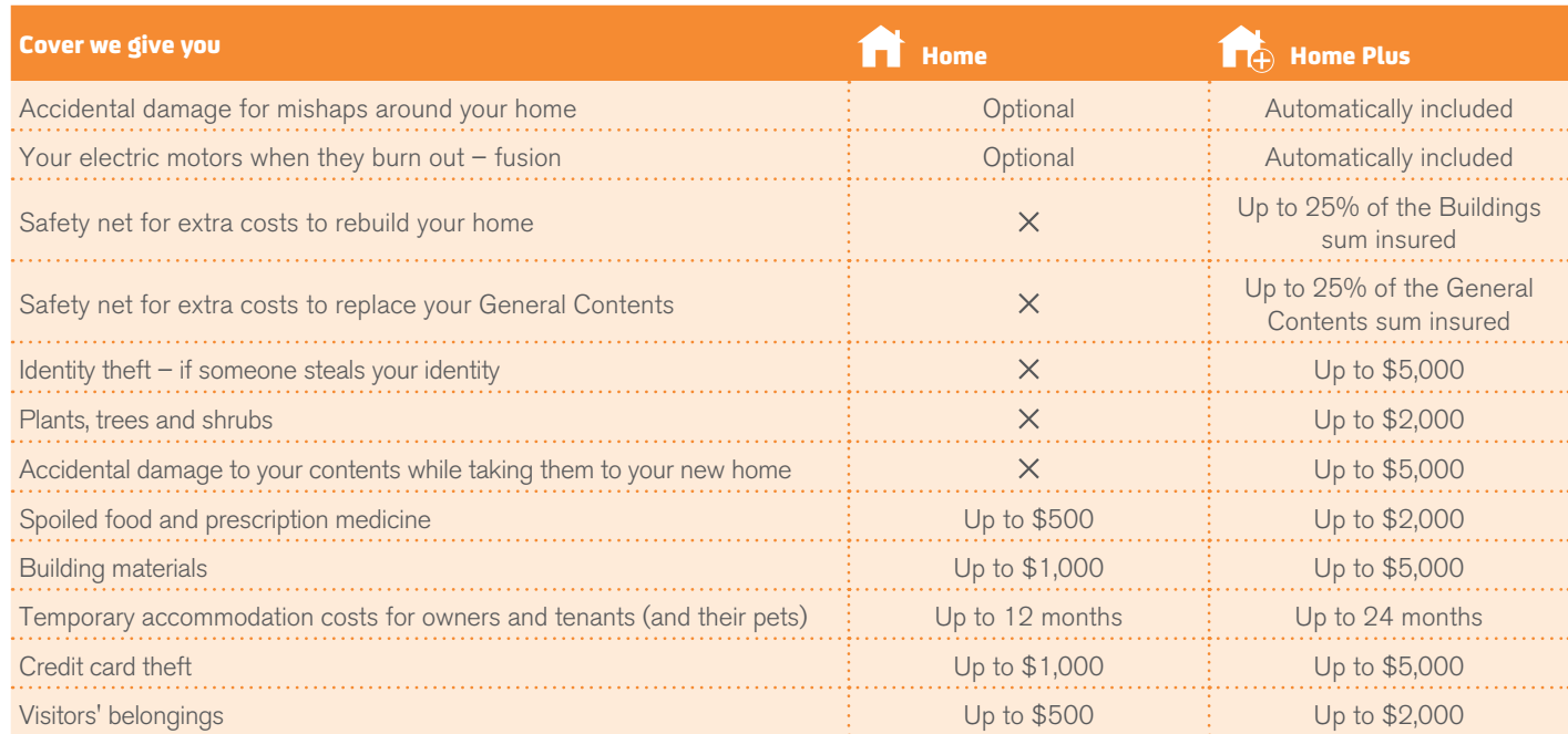
Table 1.1 – Differences between a Home policy and a Home Plus policy