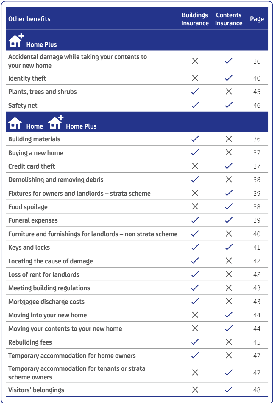
Table 3.3 – Other benefits